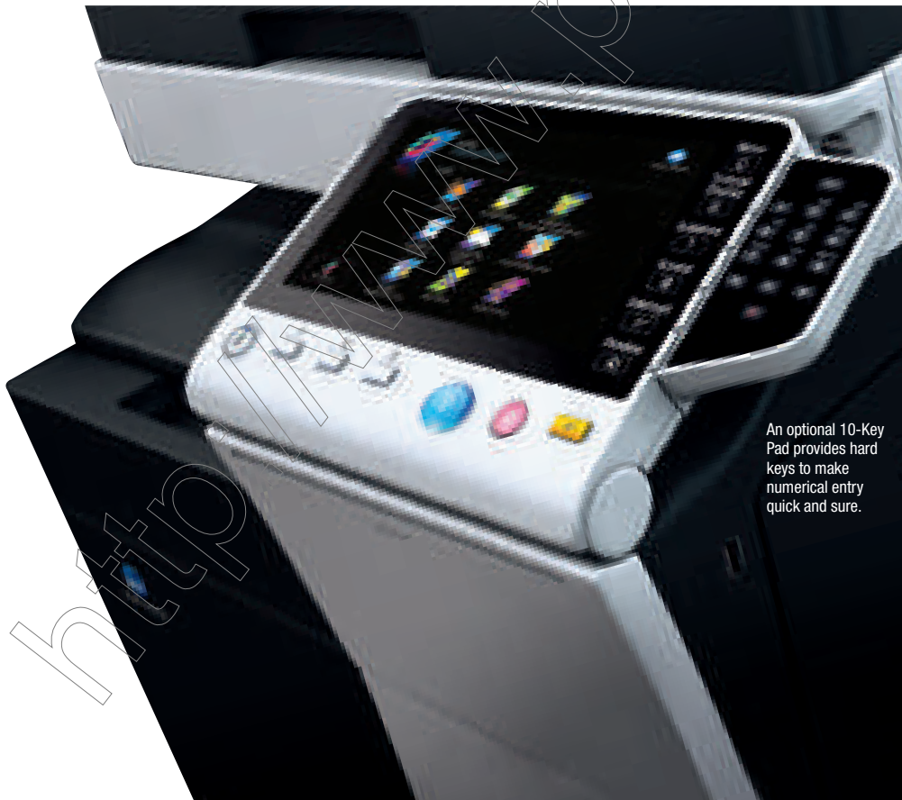
An optional 10-Key Pad provides hard keys to make numerical entry quick and sure.

In today's fast-moving digital world, needs keep changing – and Konica Minolta's EnvisionIT approach extends your power to take advantage of emerging business and professional opportunities. You'll have all the options you need: downloadable productivity apps, high-speed fax, i-Option kits and PageScope software to manage documents and devices. You'll also benefit from bEST integration with 3rd-party business software for specialized solutions – including variable-data printing, account tracking, cost recovery and more.